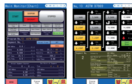
Touch-screen operating panel