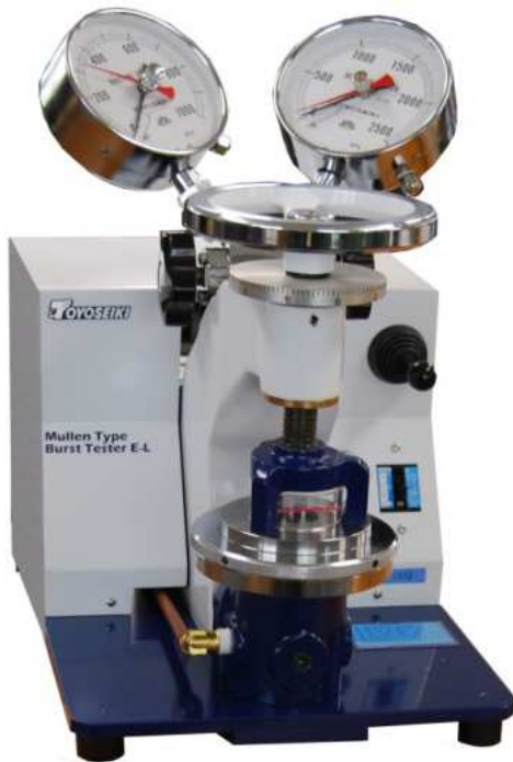
Analog pressure gauge (Standard)