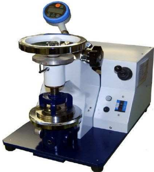
Digital pressure gauge (Option)